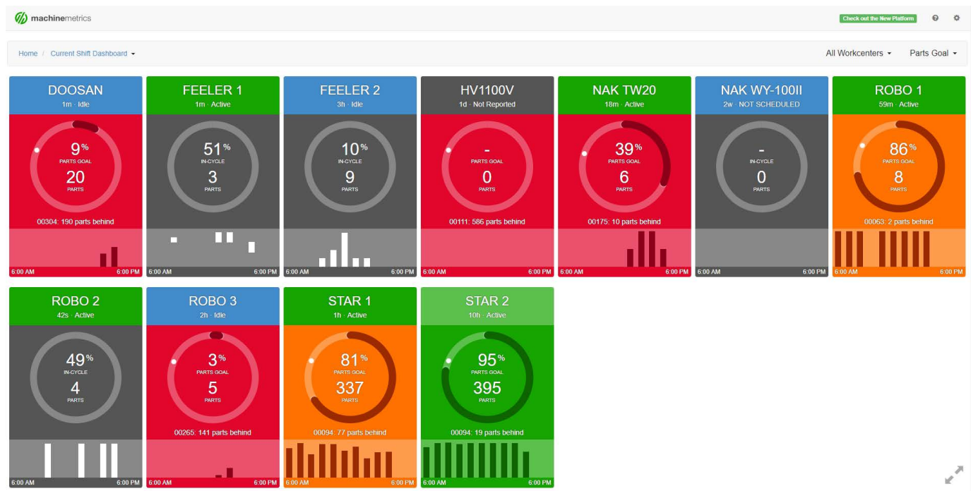
Fig. 4: MachineMetrics dashboard provides full data visibility—This integration is accessible from any web browser connected to your private local network and can even run directly on the MachineMetrics tablet.

For more information contact us: jobboss.servicesinquiry@ecisolutions.com